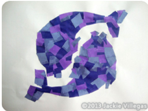
Paper mosaic fish.

As any parent will tell you, children just love cutting and pasting. Give a child some paper, a pair of scissors, and some glue and they will stay busy for hours. As long as it is done with adult supervision, this is a good practical life lesson that develops their fine motor skills as well as their creativity.