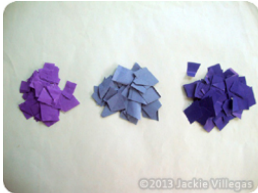
Colored paper cut into small mosaic pieces.