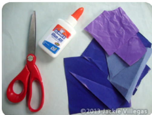
Materials needed to make a paper mosaic animal.

Making paper mosaic animals is a fun cut and paste exercise. It gives you the perfect opening to teach children about colors, animals, and new art forms. It is a simple but engrossing activity that requires few supplies and is a great way of recycling bits of paper left over from other art or craft projects.