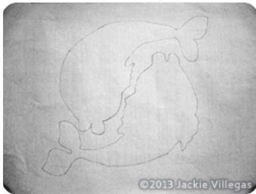
An outline of the chosen animals.

1. Decide on an animal to use for your paper mosaic. With your child, look for pictures of animals in books or magazines or online. Engage your child in conversation about each animal you see, its diet, and its habitat.